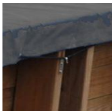
Cubierta de invierno Winter cover CI790207