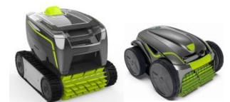
Robot Robot GT3220/GV3420