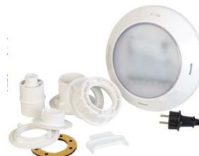
Iluminación Lightning PLWPB