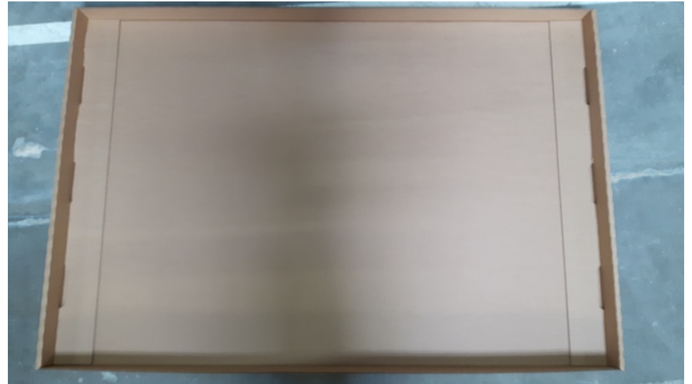
Bottom of the box