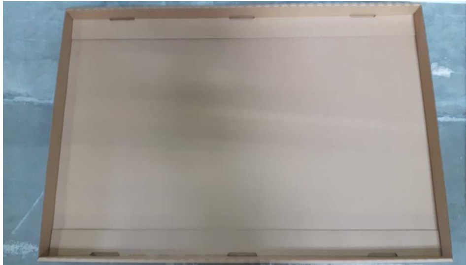
Top of the box