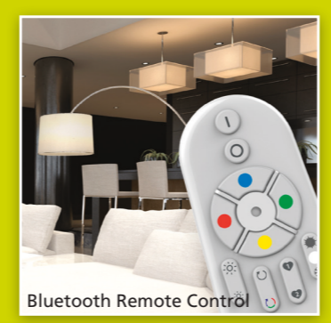
Bluetooth Remote Control